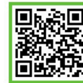
Mustang VB Boosters